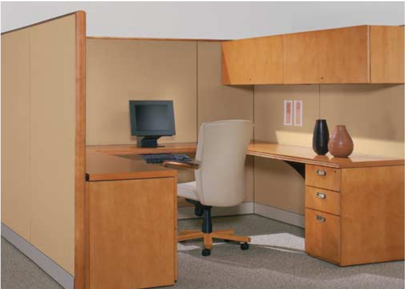
Cetra's transitional top and end trim profiles unify the style of the panels and Footprint components in this 8' X 8' space.

The system's acoustical, sectional and stackable panels tailor the space, providing a rigid structural foundation and housing all the power and communications you need. Cetra addresses every workplace application and handsomely outfits each floor plan.